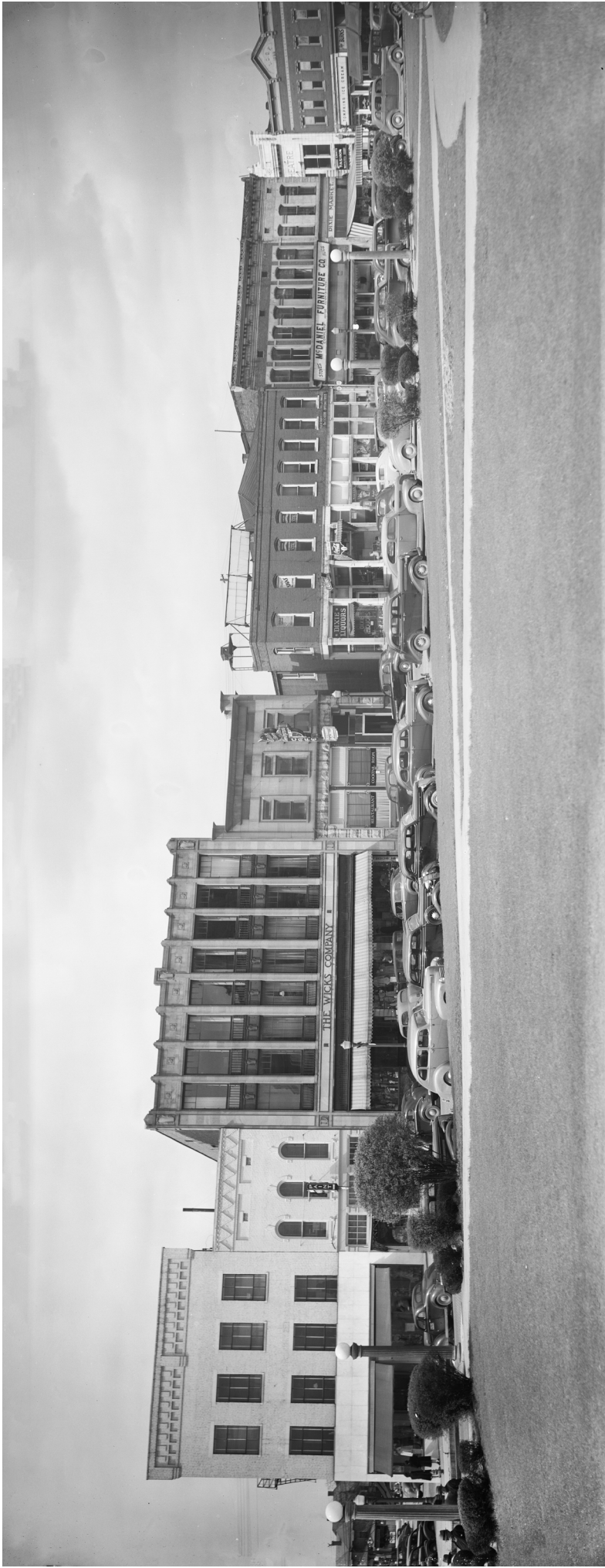
Image: 1973-11-0689, "Courthouse Square: North Side," Bloomington, IN