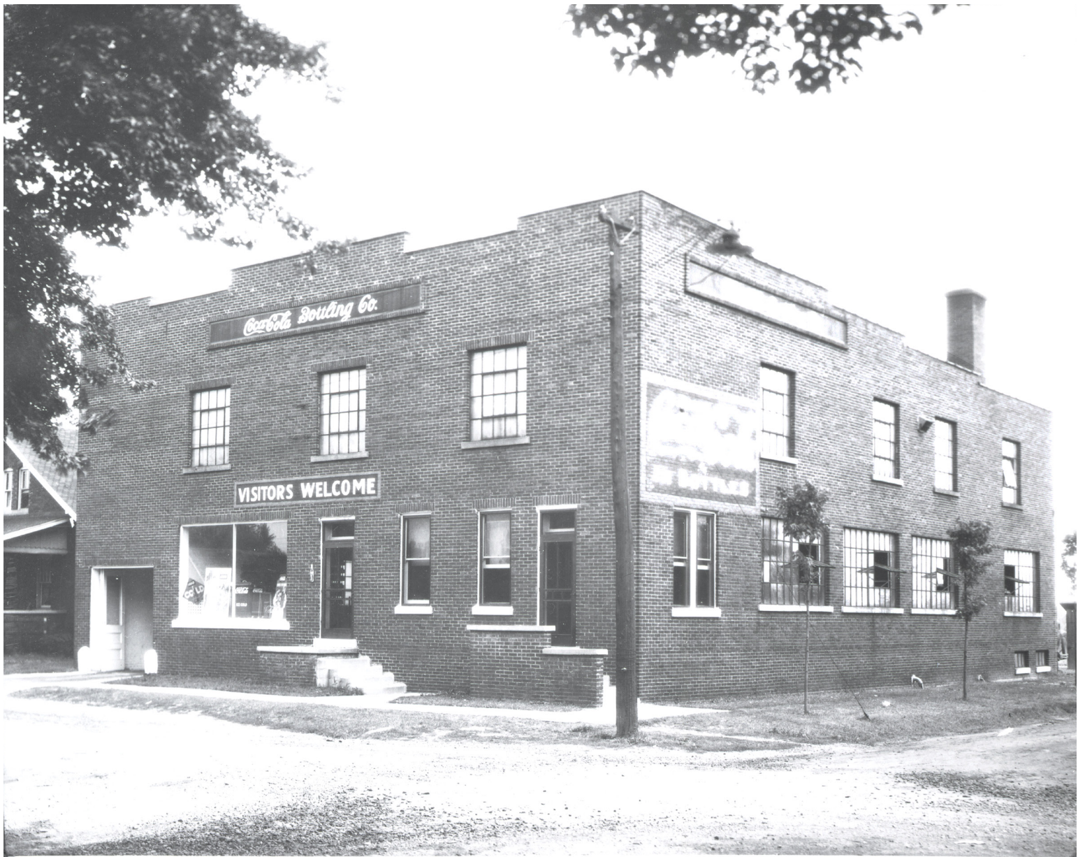
Image: 1973-11-0206, "Coca Cola Building," Bloomington, IN

Description: Coca-Cola Bottling Company building on S. Washington.