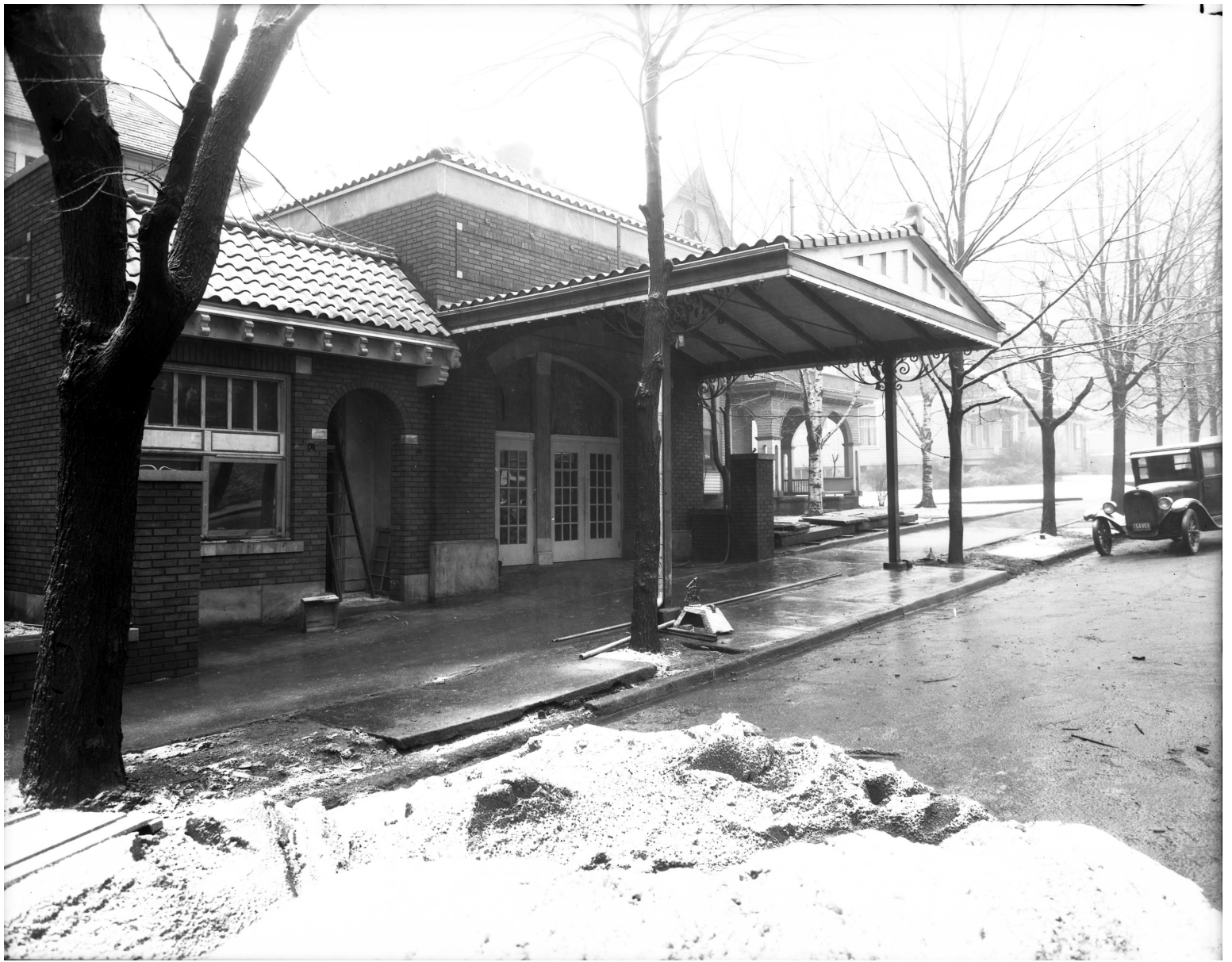
Image: 1973-11-0603, "Von Lee Theatre," Bloomington, IN

Description: The Von Lee Theatre in winter. It houses the restaurant Noodles and Company in 2023.