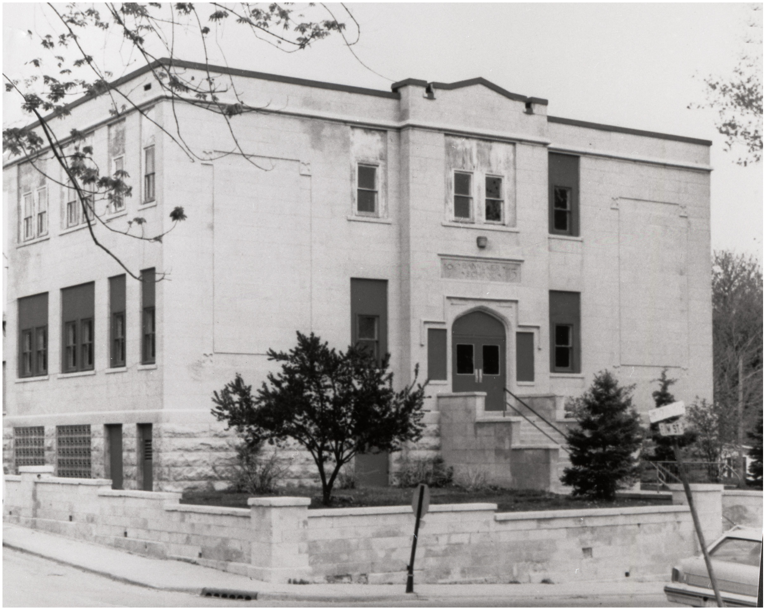
Image: 1988-12-0031, "Westside Center, Banneker School," 1960-1979, Bloomington, IN

Description: Banneker School. Now the Banneker Community Center.