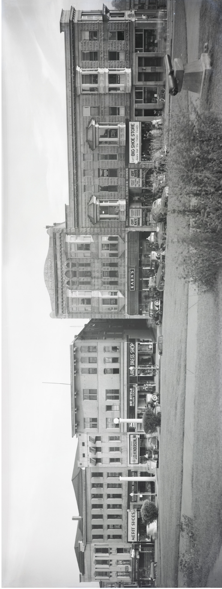
Image: 1973-11-0687, "Courthouse Square: South Side," Bloomington, IN