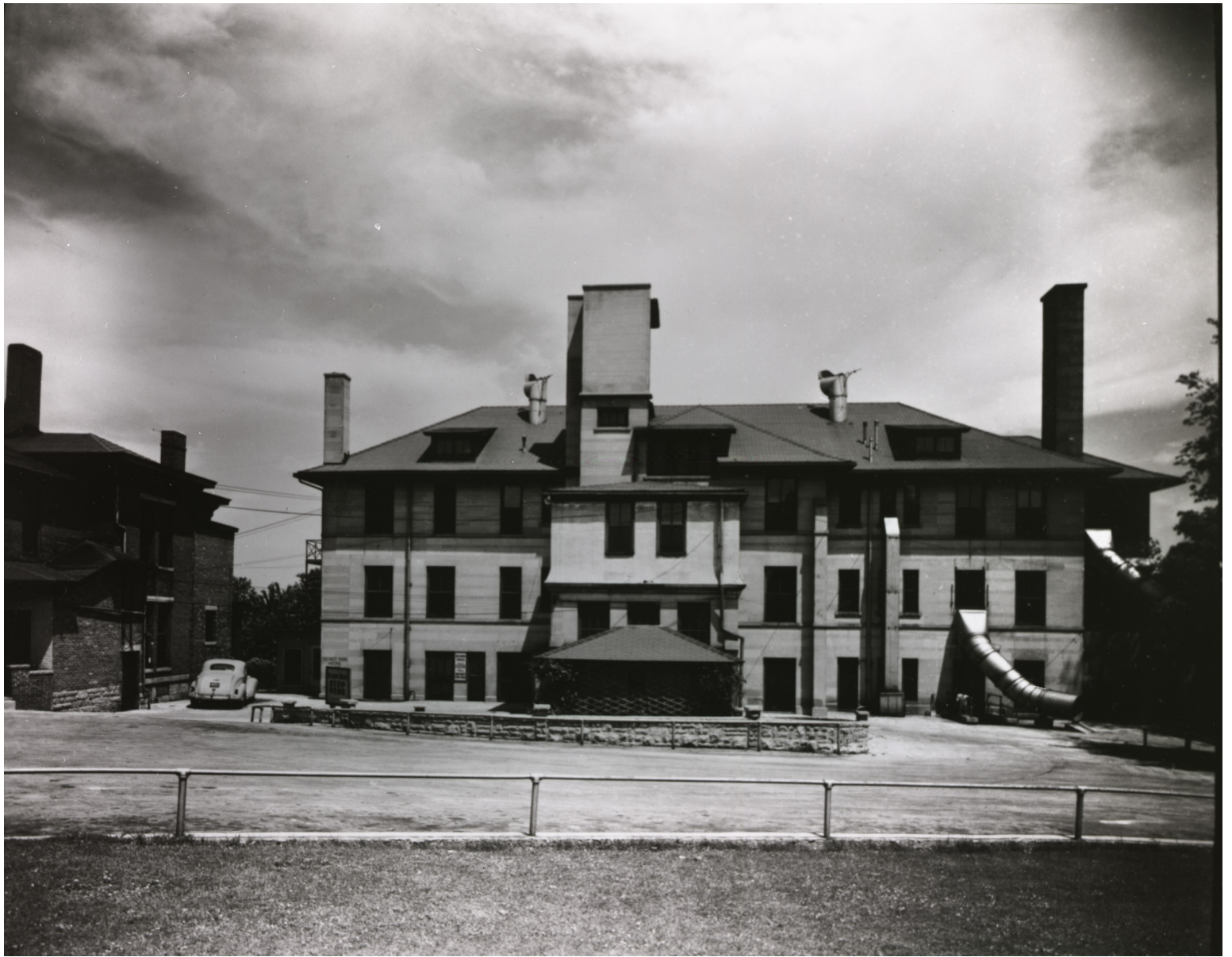
"Blomington Hospital," Bloomington, IN

Description: The old Bloomington Hospital located at 2nd and Rogers.