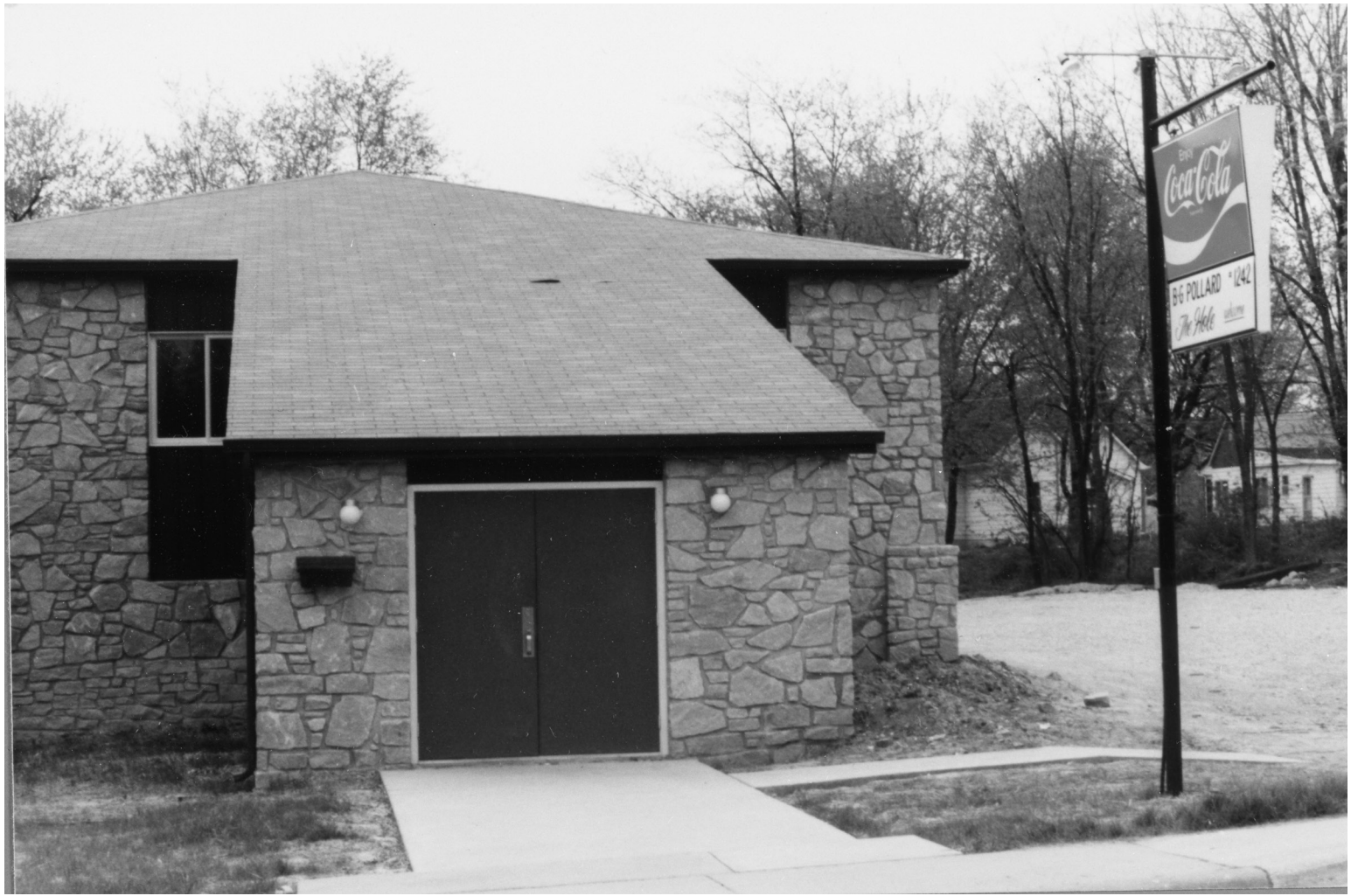
Image: 1988-12-0124, "Elks Lodge," 1980s, Bloomington, IN

Description: B.G. Pollard Lodge, Elks Lodge #1242. The basement housed The Hole, a nightclub and social hub for the African American community in Bloomington.