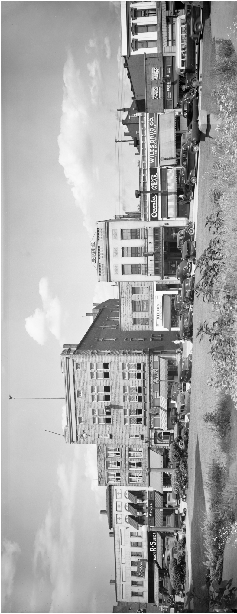
Image: 1973-11-0685, "Courthouse Square: East Side," 1939, Bloomington, IN